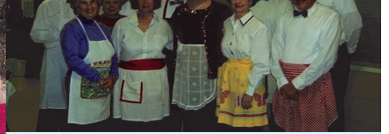
Our gracious and happy servers from Westland United Methodist Church!