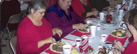
That sure was some good prime rib at the banquet..... And the cheese- cake was a great finale to the deli- cious meal prepared by