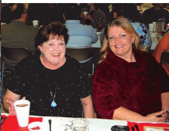
OK now... what's in that iced tea that's making