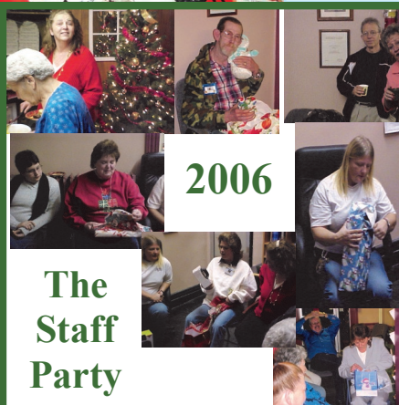
The Staff Party