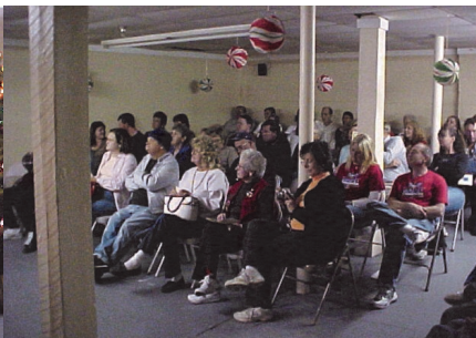
We had a full house for the