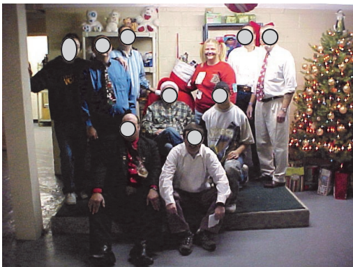
The cast of "How Nick Became a Saint"