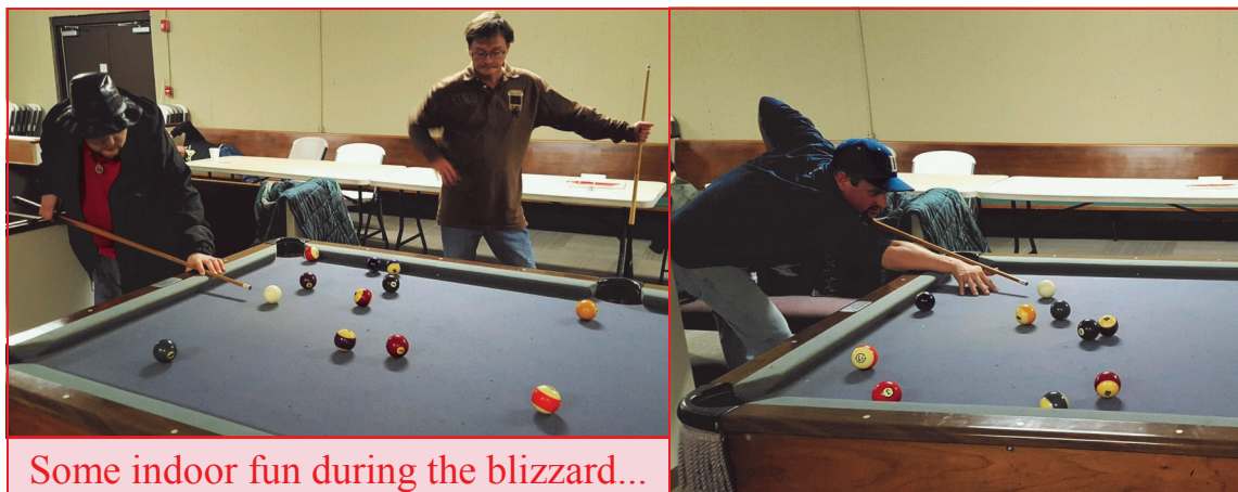
Some indoor fun during the blizzard...

Our Mission Statement Matthew 25:31-46 Volume 19 Issue 2